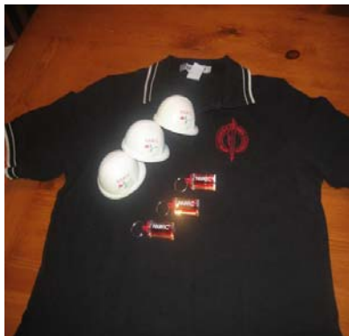
Black Polo Shirt Stress Hats Key Chains

If you want or need any NAWIC gear, let me know: yasmine@usfamily.net or 503.701.5871